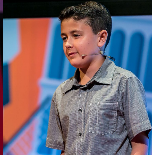
MAX Tics, tics, tics TEDxKidsElCajon 2019