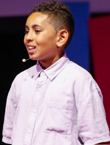
JEREMIAH Understanding Differences TEDxKidsElCajon 2023